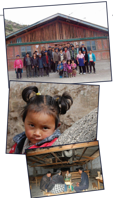
The local Christians gather. • A shy small child takes a moment to look at the camera. • A group of Christians eat a meal in a local church.